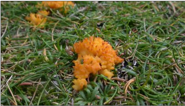
Plate 11: Clavulinopsis corniculata , dwarf form. In Festuca rubra turf near the North Light. November 2004.