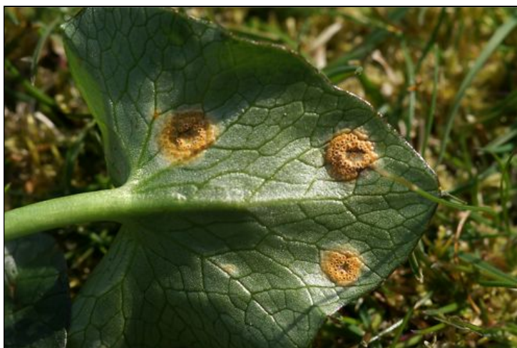
Plate 14: Uromyces dactylidis , Aecidia on Ranunculus ficaria (celandine). Upper Millcombe Valley. April 2005.