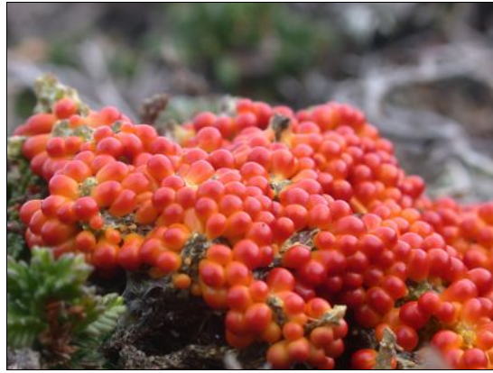
Plate 24: Leocarpus fragilis (Myxomycete) fruiting on Calluna . North End. November 2004.

It could be asked whether a study of fungi on Lundy has any scientific value. Any of the fungi recorded would be likely to be also present on the mainland. However, the account presented in this chapter highlights a number of counter arguments. Firstly the national conservation status of Lundy means that a complete inventory of the organisms present is highly desirable, and although the lichens, part fungus, part alga, have been previously well