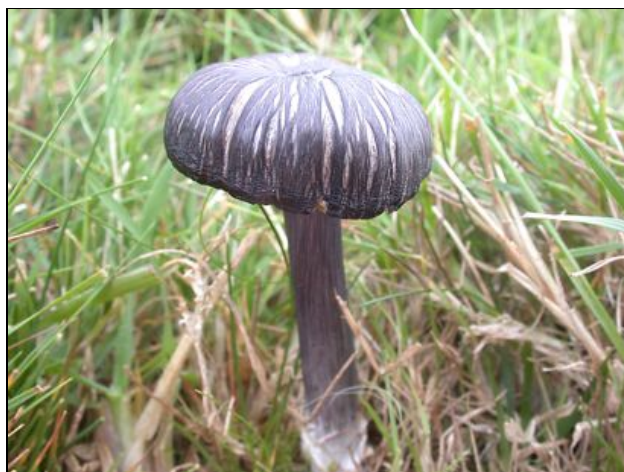
Plate 23: Entoloma ( lampropus group). The Airfield. November 2004.