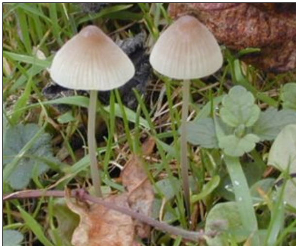
Plate 8: Mycena filopes under willow in the Quarries. October 2003.

the 'shaggy parasol mushroom', Macrolepiota rhacodes , found in November 2003 fruiting in the nettles by the Castle (Hedger & George, 2004), but probably also present in the Millcombe Valley. This is similar to the 'parasol mushroom', M. procera , widespread in autumn in the grassland around the Old Light, but differs in having a scaly stem and in slow reddening of the flesh of the stem when bruised or cut.