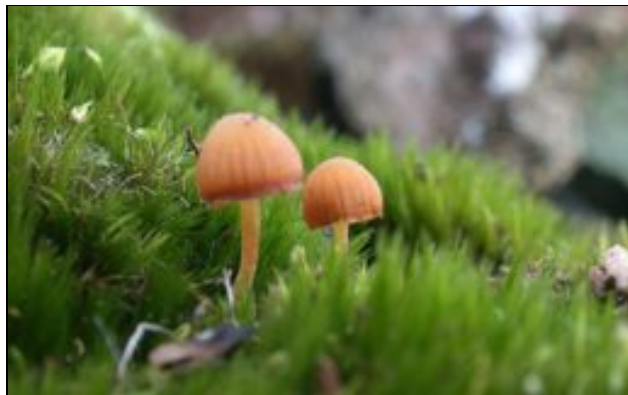
Plate 12: Galerina hypnorum . In moss on the edge of the path to the Battery. November 2004.