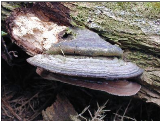
Plate 4: Phellinus tuberculoso on dead gorse, behind Brambles. October 2003.