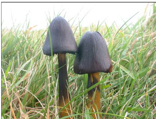
Plate 21: Hygrocybe conica . The Airfield. November 2004.