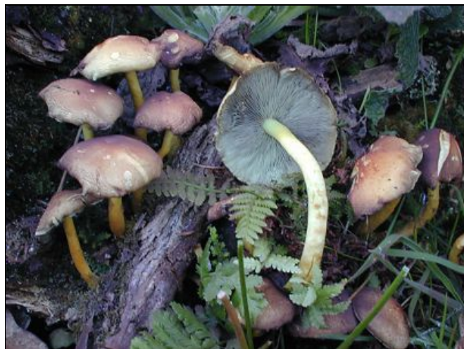
Plate 7: Hypholoma fasciculare (sulphur tuft) on dead rhododendron near The Ugly. October 2003.