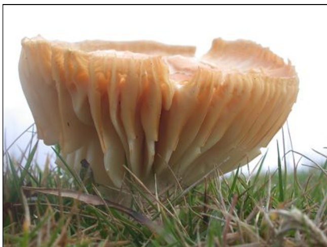
Plate 20: Hygrocybe pratensis . The Airfield. November 2004.