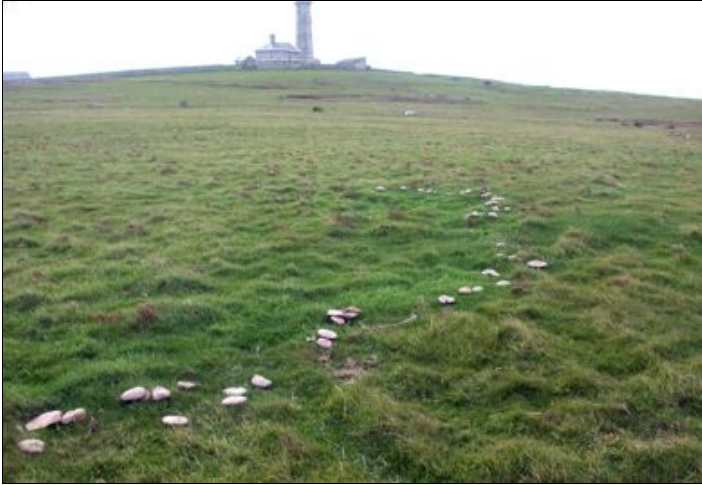
Plate 16: Ring of Lepista nuda (wood blewitt) near the Airfield. November 2004.