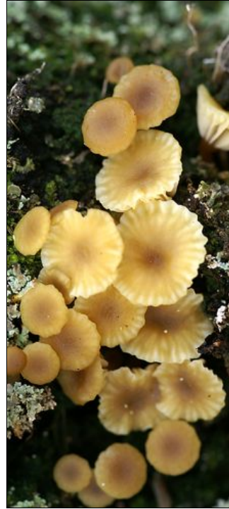
(Right) Plate 10: Omphalina (Gerronema) ericetorum on wet peat. Coast path, Gannets Bay. April 2005.