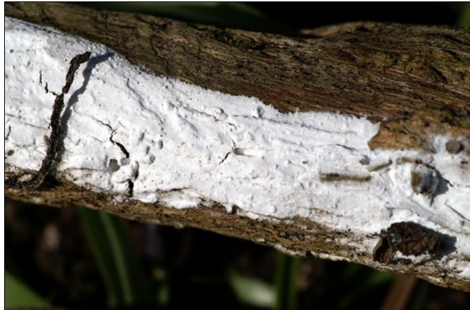
Plate 3: Lyomyces sambuci on dead elder in the Walled Garden, Millcombe Valley. April 2005.