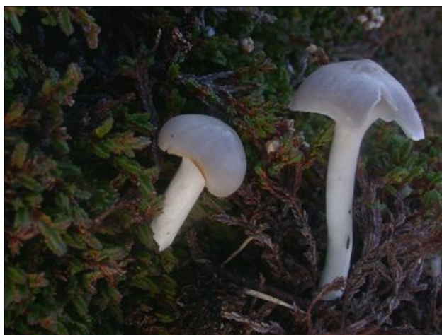
Plate 22: Hygrocybe radiata . Young fruit bodies. North End. November 2004.

and H. pratensis (Plate 20), (honey coloured). Smaller species included the bright green, later lilac or yellow, H. psittacina , H. conica , (Plate 21), orange-red, blackening with age, and the small white-cream species H. russocoriacea , which smells of leather. However, absence of improvement of the grassland is not the only factor affecting Hygrocybe species distribution on Lundy. In the much more acidic tall grassland north of Quarter Wall and around Pondsburry and just north of Threequarter Wall we found only H. laeta , a pinkish-brown medium-sized species, also found in the short turf areas, but presumably more tolerant of low soil pH. An even more interesting result in November 2004 was the finding of a medium-sized grey species of Hygrocybe fruiting abundantly on the thin peaty soil under the Calluna in the immediate vicinity of the Bronze Age fort at the North End of Lundy. This agaric was never seen in any other location on Lundy and appears to be H. radiata , (Plate 22), a northern European species, which has yet to be recorded for the U.K. according to Boertmann (1995). A dried specimen of this fungus has been deposited in the mycological herbarium at the Royal Botanic Gardens, Kew and will soon be subjected to critical determination by a specialist.