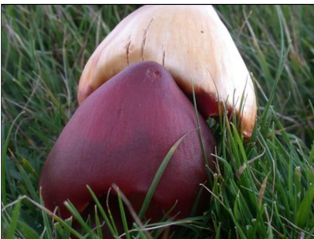
Plate 18: Hygrocybe punicea . The Airfield. November 2004.