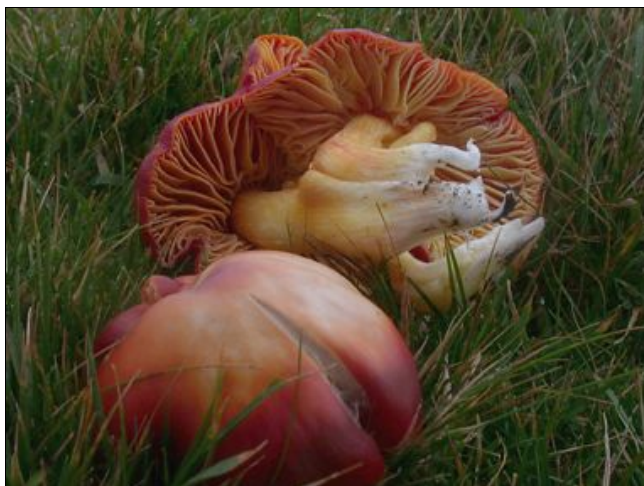
Plate 19: Hygrocybe splendissima . The Airfield. November 2004.