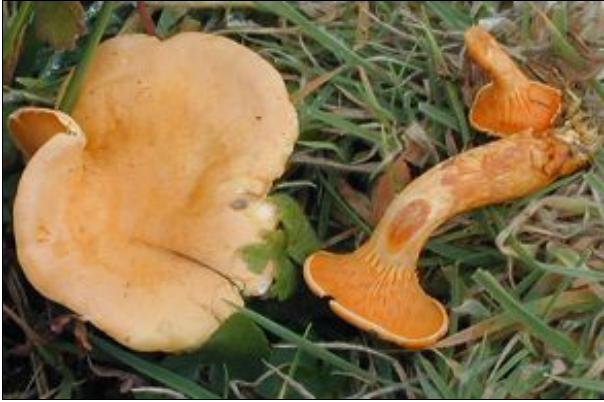
(Above) Plate 9: Hygrophoropsis aurantiacum (false chanterelle) under bracken, near Brazen Ward. October 2003.