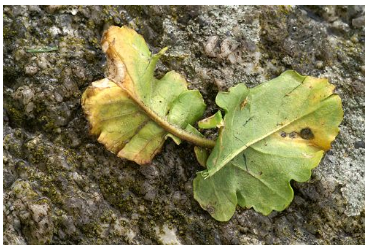
Plate 15: Possible Mycosphaerella sp. On Coincya wrightii (Lundy cabbage). Beach Road. April 2005.