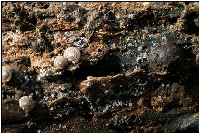
Plate 6: Mollisia cinerea on dead willow in the Quarries. April 2005.