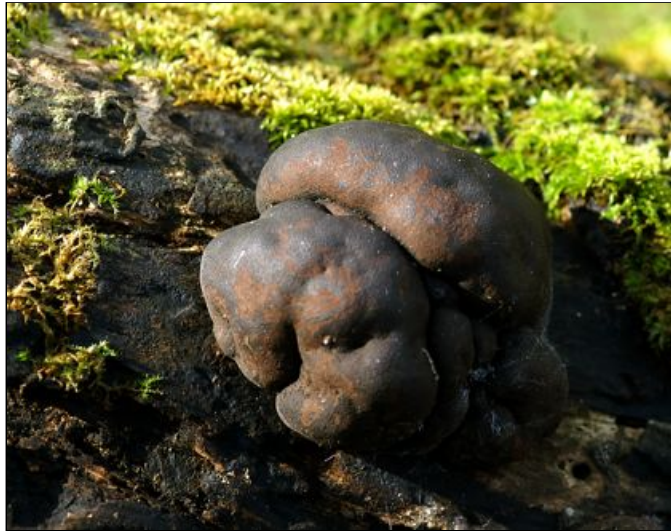
Plate 5: Daldinia concentrica (King Alfred's cakes) on dead ash in Millcombe Valley. April 2005.