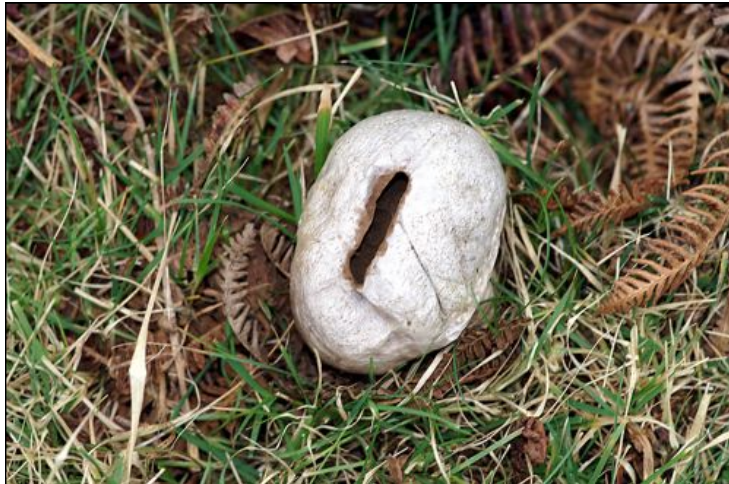
Plate 17: Vascellum depressum . Old fruit body. The Airfield. January 2006.