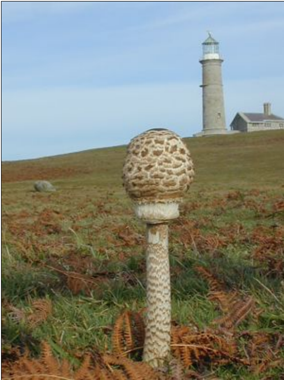
Plate 1: Macrolepiota procera (parasol mushroom) with the Old Light in the background. October 2003.