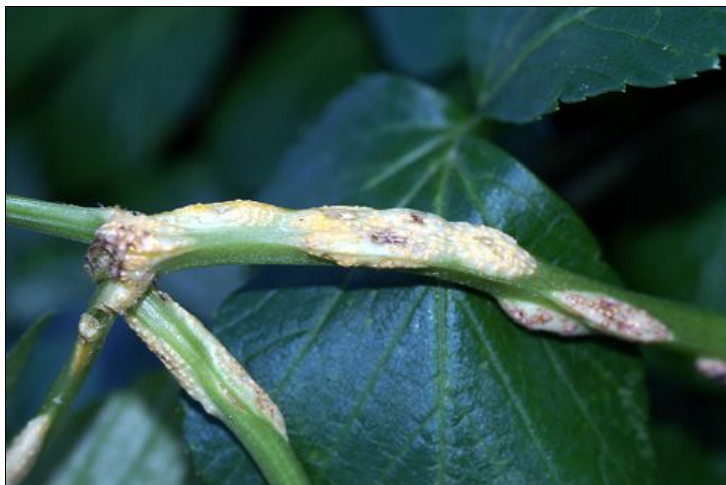
Plate 13: Puccinea smyrniai , Aecidia on Smyrnum olusatrum (alexanders) in Lower Millcombe Valley. January 2006.