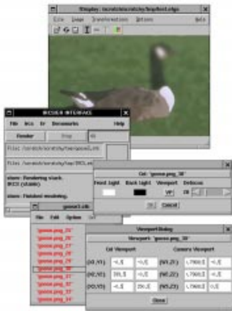
Figure 3: The rendering interface

colours. Common signal analysis tools like Fourier transforms should provide a better way of handling texture reproduction.