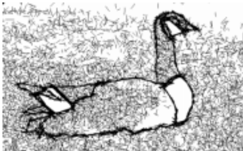
Figure 1: Pen and Ink Rendering

want to render an image as if it had been drawn by a technical illustrator, as if it had been sketched and inked (as in cartoons and comic-strips), or painted (using a variety of techniques such as watercolour, airbrushing, etc. ). The vector representation of image features makes it very simple to produce some of these effects, as is shown in Figure 1, where the outline of each region as well as the textures have been rendered using randomly distributed line segments to simulate a pen-and-ink illustration.