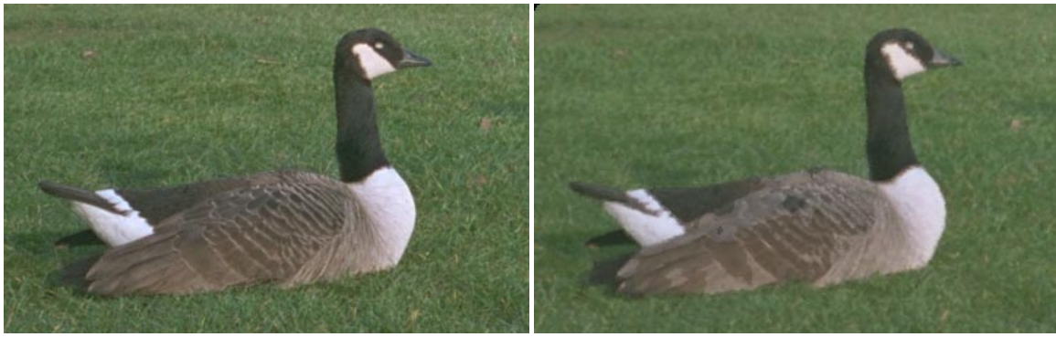
Figure 4: Sample image (left) and image generated from vector representation (right)