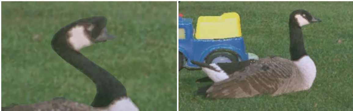
Figure 6: Special effects: warping (left) and merging (right)