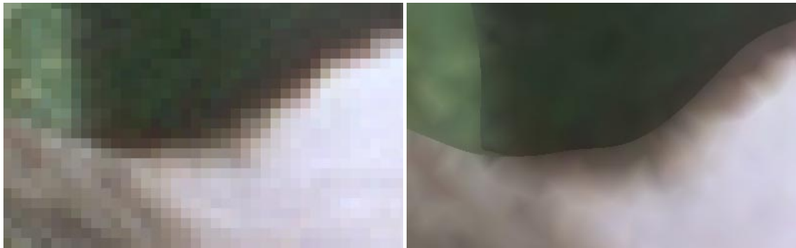
Figure 5: Close-up of the original image (left) and from vector representation (right)